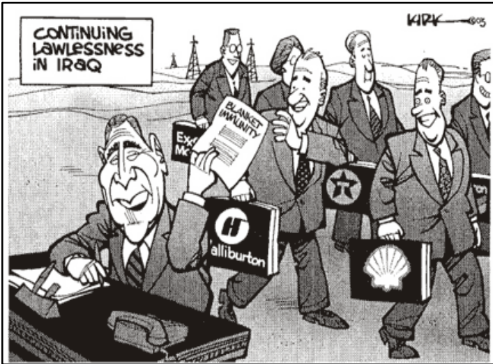
From Z Magazine, December 2003

The INVASION of IRAQ is part of a war ... but it's a war on U.S. WORKING PEOPLE and OUR STANDARD of LIVING